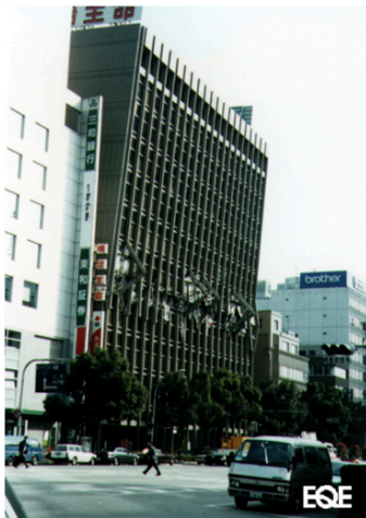
Weak story failure, Kobe, 1995