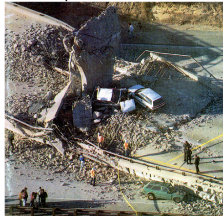
Inadequate connection to uprights